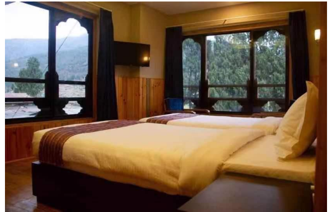
Standard Twin Single