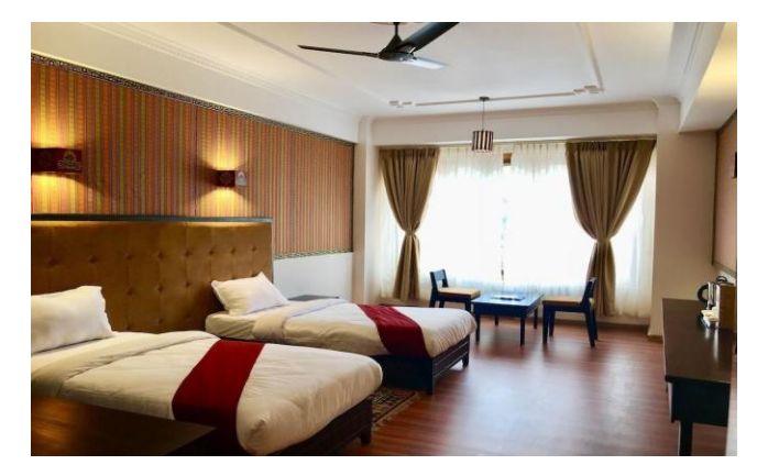
Deluxe Double or Twin