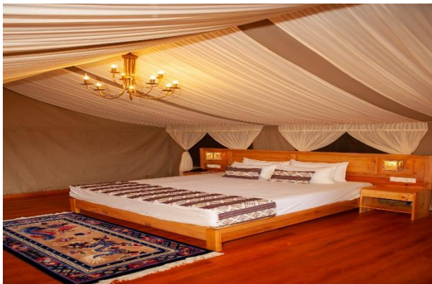
Deluxe Double Bed Room