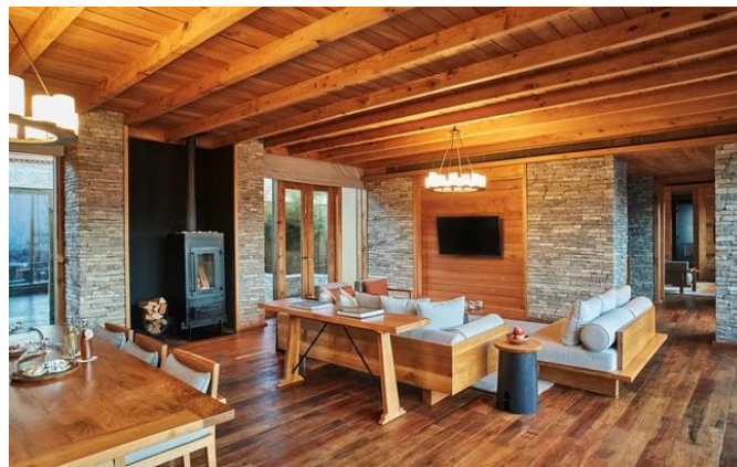
Three Bedroom Villa