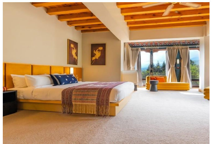
Takin or Blue Poppy Suite