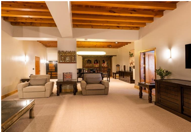
Royal Raven Suite