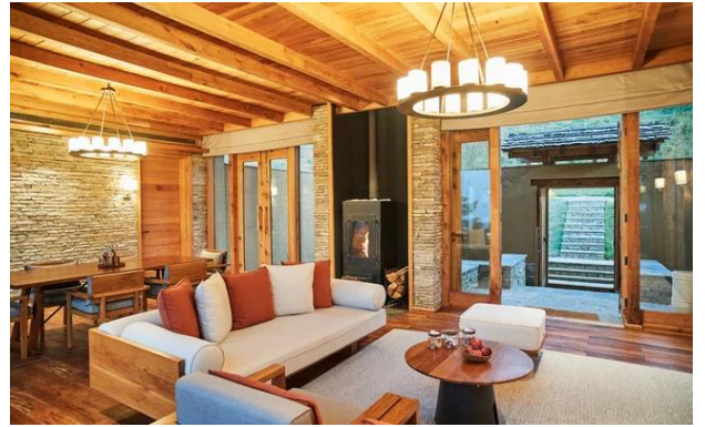
Two Bedroom Villa