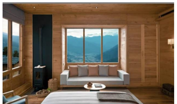
Upper Lodge Suite