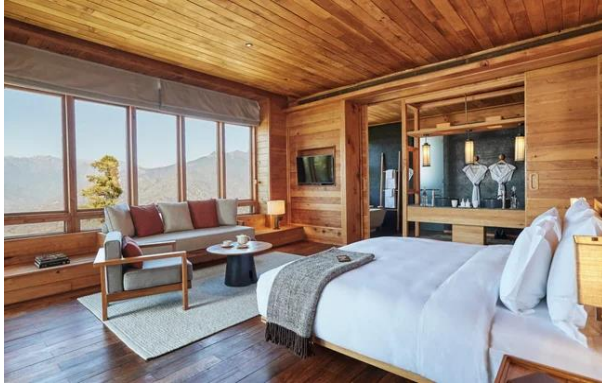
One Bedroom Villa