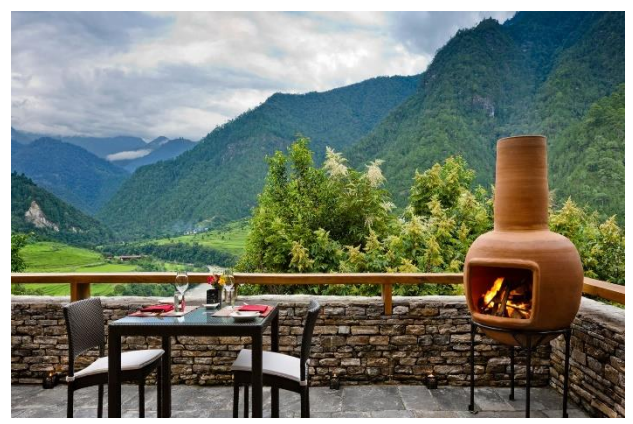
One Bedroom Villa