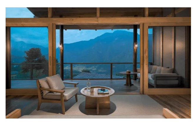
Upper Lodge Suite