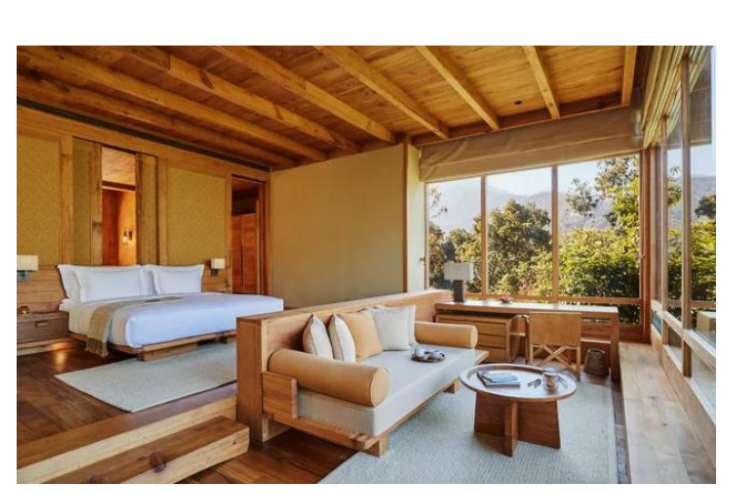
One Bedroom Villa