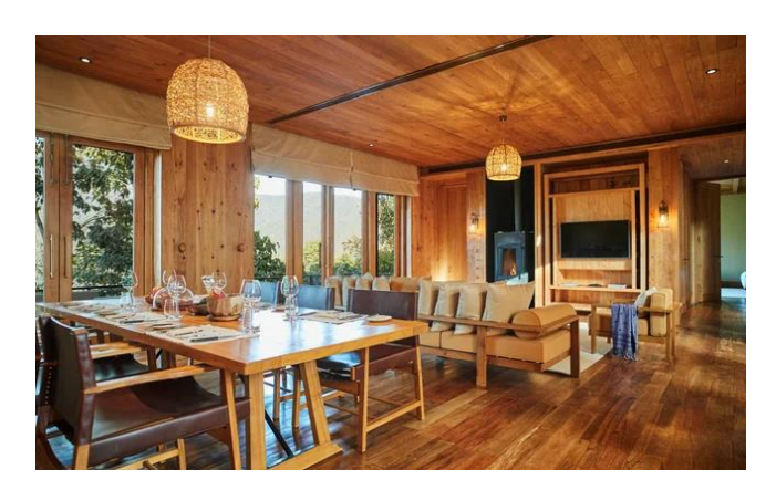
Two Bedroom Villa