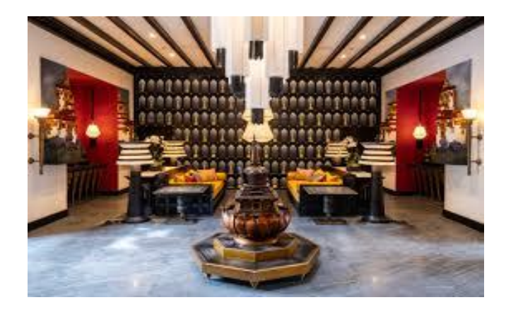
Luxury Tented Villa