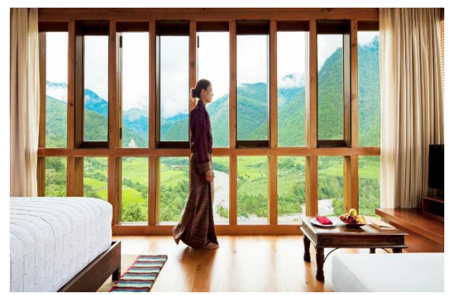
Valley Room King Bed