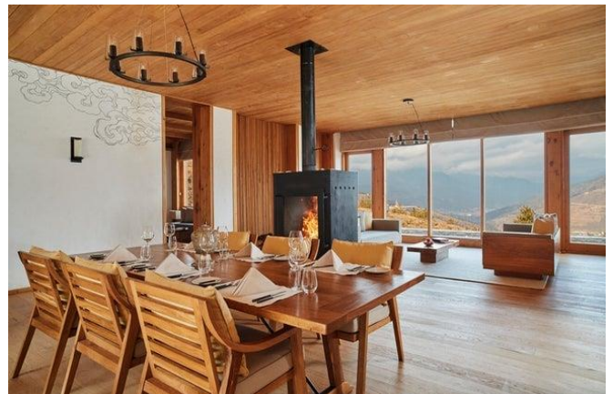
Two Bedroom Villa