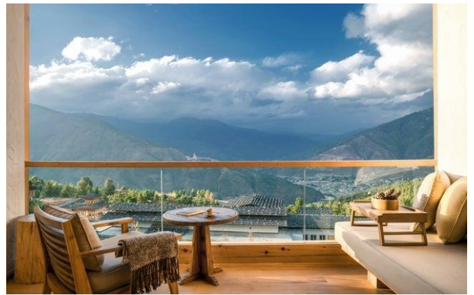
Upper Lodge Suite