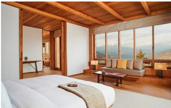
One Bedroom Villa