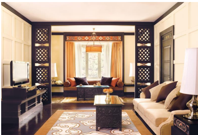
Deluxe Mountain View